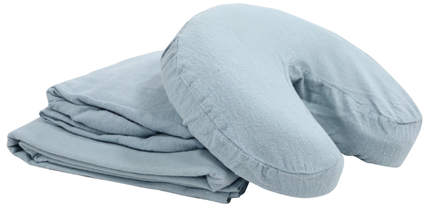
SHT SET 3pc

The Deluxe Double Brushed Cotton Flannel 3 Piece Sheet Set includes a flat sheet, fitted sheet, and face rest cover. Flannel massage sheets are lightweight and perfect for your table year round, providing a perfect balance between comfy and cozy. These high quality flannel sheets are double brushed for extra softness and made with 100% cotton, making it easier to get lotion, creams, and oil stains out. Flannel sheets will take the chill off and make it easier to provide a deep, relaxing experience for your clients.