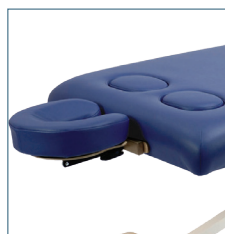
Breast Recesses Option - Breast/Scapula Recesses include dual cutouts with central sternum/spine support (includes custom plugs)