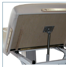
PTB - Power Tilt Back with Hand Control