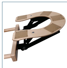
UP DPOS-B - Upgrade from Dual Action Face Rest Base to Deluxe Adjustable. Full range of adjustment is 4-6".