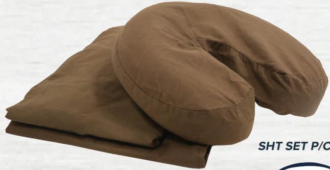
SHT SET P/C 3pc

The Premium Blend Poly/Cotton 3 Piece Sheet Set includes a flat sheet, fitted sheet, and face rest cover. These sheets are durable, affordable, and provide a wrinkle free, lightweight comfort that is normally only found with more expensive sheets. With an oversized flat sheet you can ensure your clients will be covered 100% of the time, allowing them to remain relaxed through position changes. The poly/cotton sheets are made specifically for massage tables and will give you the fit you desire.