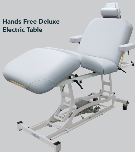
Hands Free Deluxe Electric Table