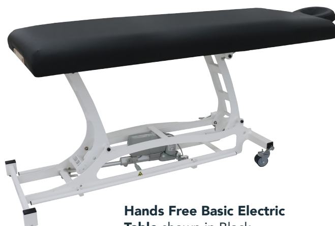
Hands Free Basic Electric Table shown in Black