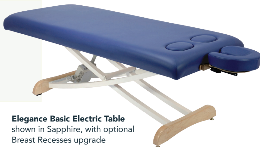
Elegance Basic Electric Table shown in Sapphire, with optional Breast Recesses upgrade