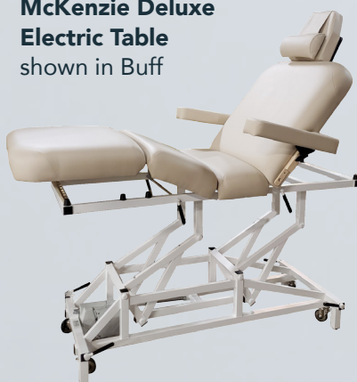
McKenzie Deluxe Electric Table shown in Buff