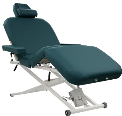
Pro Deluxe Electric Table shown in Jade