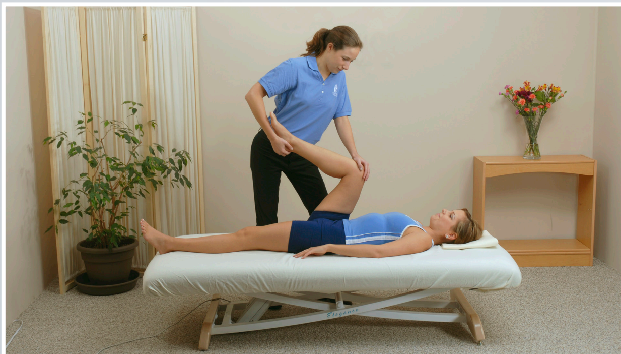
Elegance Electric Table Shown

Different therapists work at different table heights for optimal leverage and ergonomics. Working on a table that is too low or too high and transporting a heavy portable table on a regular basis can increase strain on the wrists and back as well as contribute to injury, fatigue and “therapist burn out”. With a portable or stationary table, it is difficult to make an adjustment during the massage or set the table up properly based on the needs of each client, but not so with Electric Massage Tables. Many therapists consider acquiring an Electric Massage Table an essential component to their commitment to self-care.