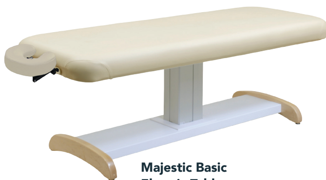
Majestic Basic Electric Table shown in Ivory with optional rounded corners