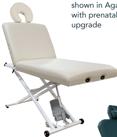
Pro Lift Back Electric Table shown in Buff