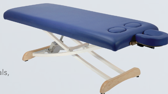
Elegance Basic Electric Table shown in Sapphire with optional Breast Recesses upgrade

PRO TIP: Because an electric table can be lowered to the optimal working height regardless of width, many therapists opt for a wider table for client comfort.