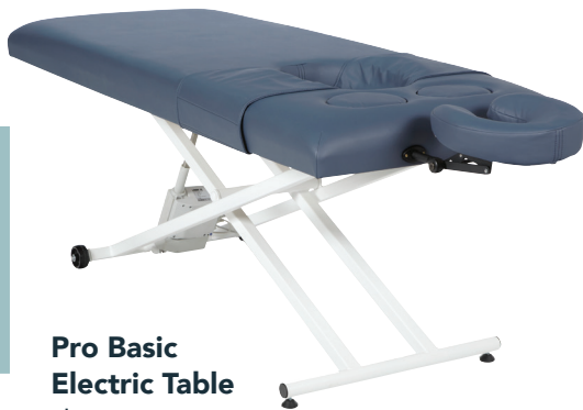
Pro Basic Electric Table shown in Agate with prenatal upgrade