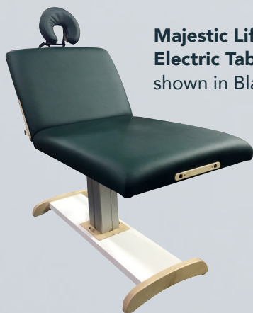
Majestic Lift Back Electric Table shown in Black