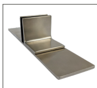
MOUNTING BASE x 2 PART #: S54-3000