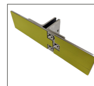
DOUBLE SIDED TAPE