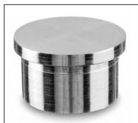
END CAP (2) Ø1.5" GLUED CAP FOR TOP OF POSTS