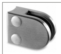
GLASS CLAMP (4) ROUNDED GLASS CLAMPS

NOTE: (2) gaskets are required for each clamp