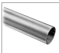
ROUND POST (2) Ø1.5" ROUND POSTS 40" LONG WITH .078" WALL THICKNESS, PREDRILLED

304 Stainless Steel #4 Brushed Finish Part #: M43-0900-038-12