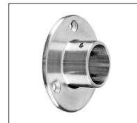
BASE FLANGE (2) Ø1.5" GLUED BASE FLANGE FOR BOTTOM OF POSTS

304 Stainless Steel #4 Brushed Finish Part #: M43-0900-038-12