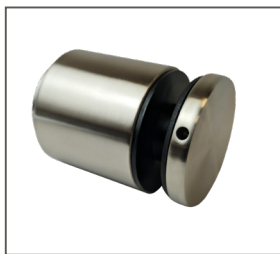
ADJUSTABLE STAND-OFF 2" Dia. Standoff with Multi-Way Adjustable Base