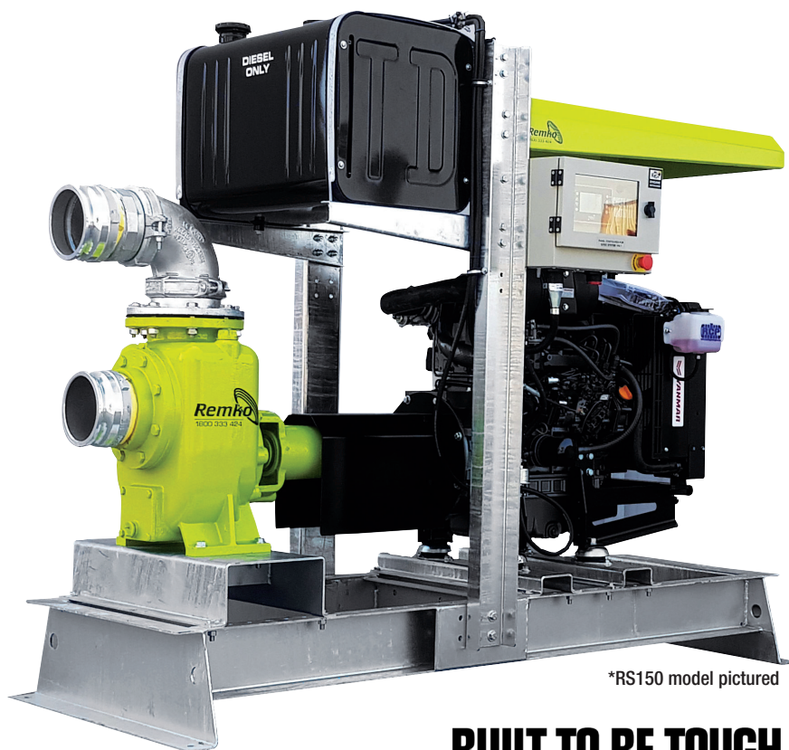
*RS150 model pictured