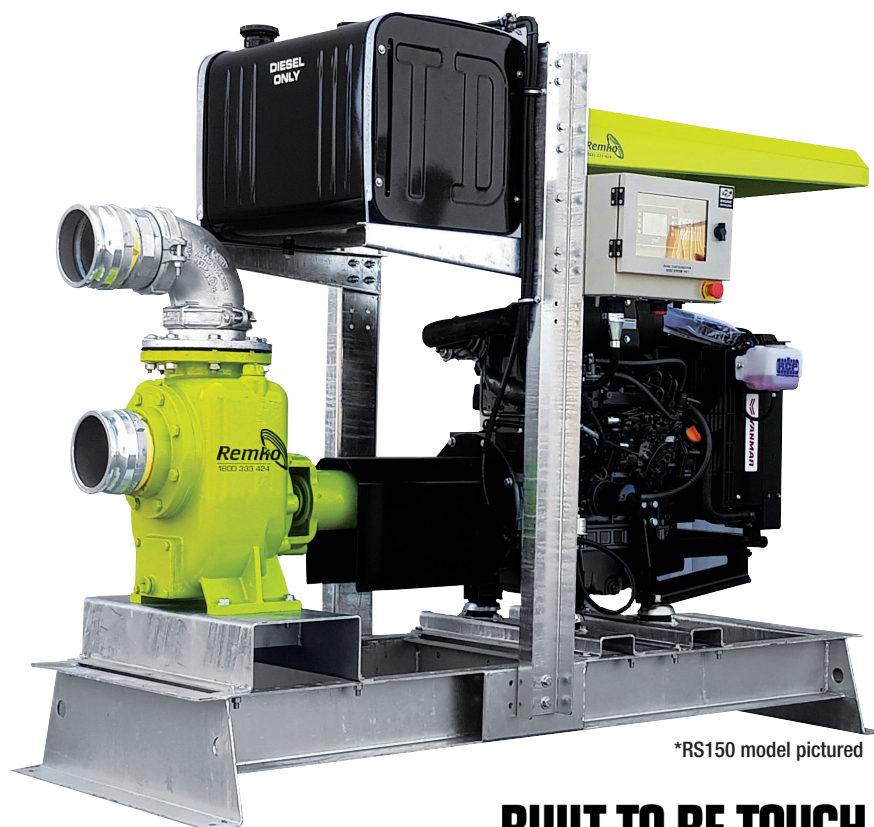
*RS150 model pictured