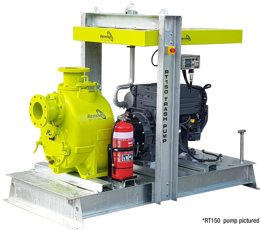
*RT150 pump pictured