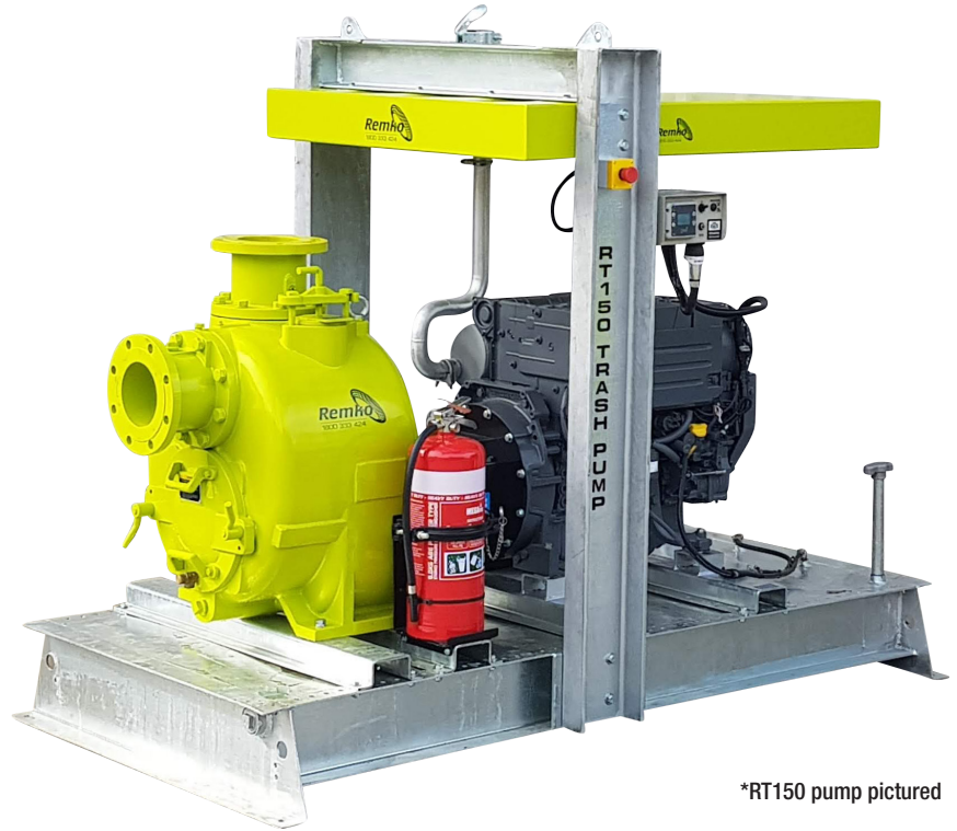
*RT150 pump pictured