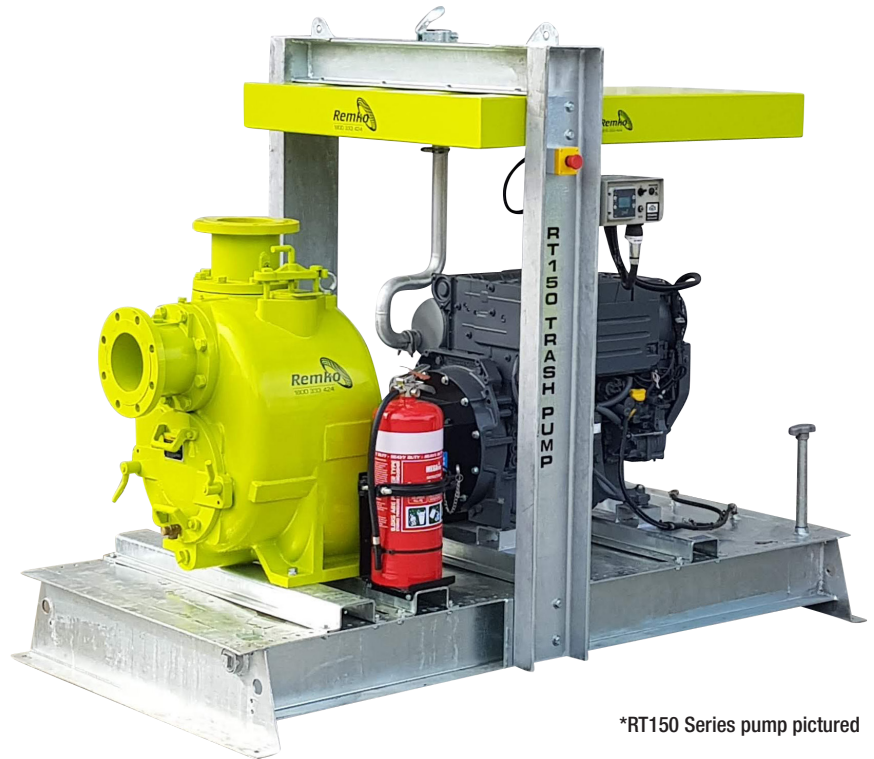
*RT150 Series pump pictured