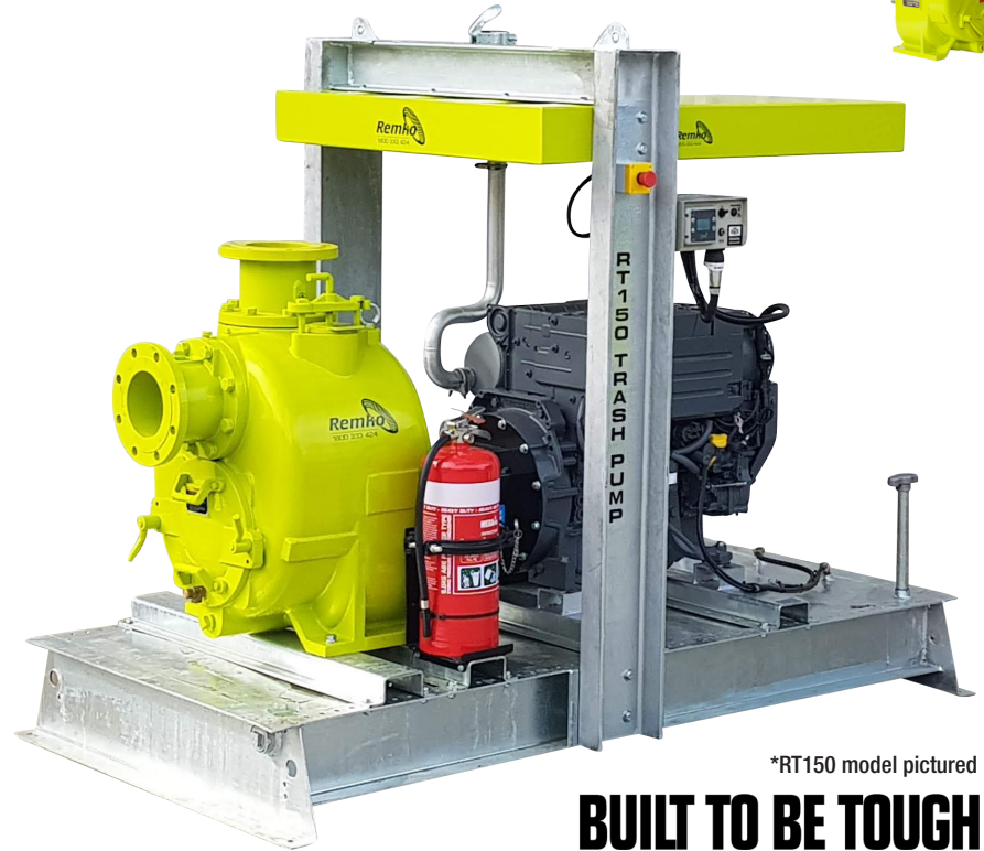
*RT150 model pictured