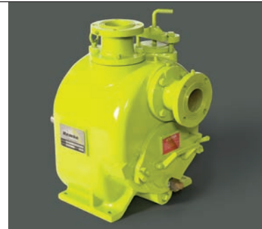
The Remko RT050 Trash Pump

RT Series Pumps are ideally suited for industrial applications including: steel and paper mills, abattoirs, mines, food and chemical processing plants, construction industry, dewatering, trade waste and sewage handling.