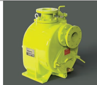
The Remko RT100 Trash Pump

RT Series Pumps are ideally suited for industrial applications including: steel and paper mills, abattoirs, mines, food and chemical processing plants, construction industry, dewatering, trade waste and sewage handling.