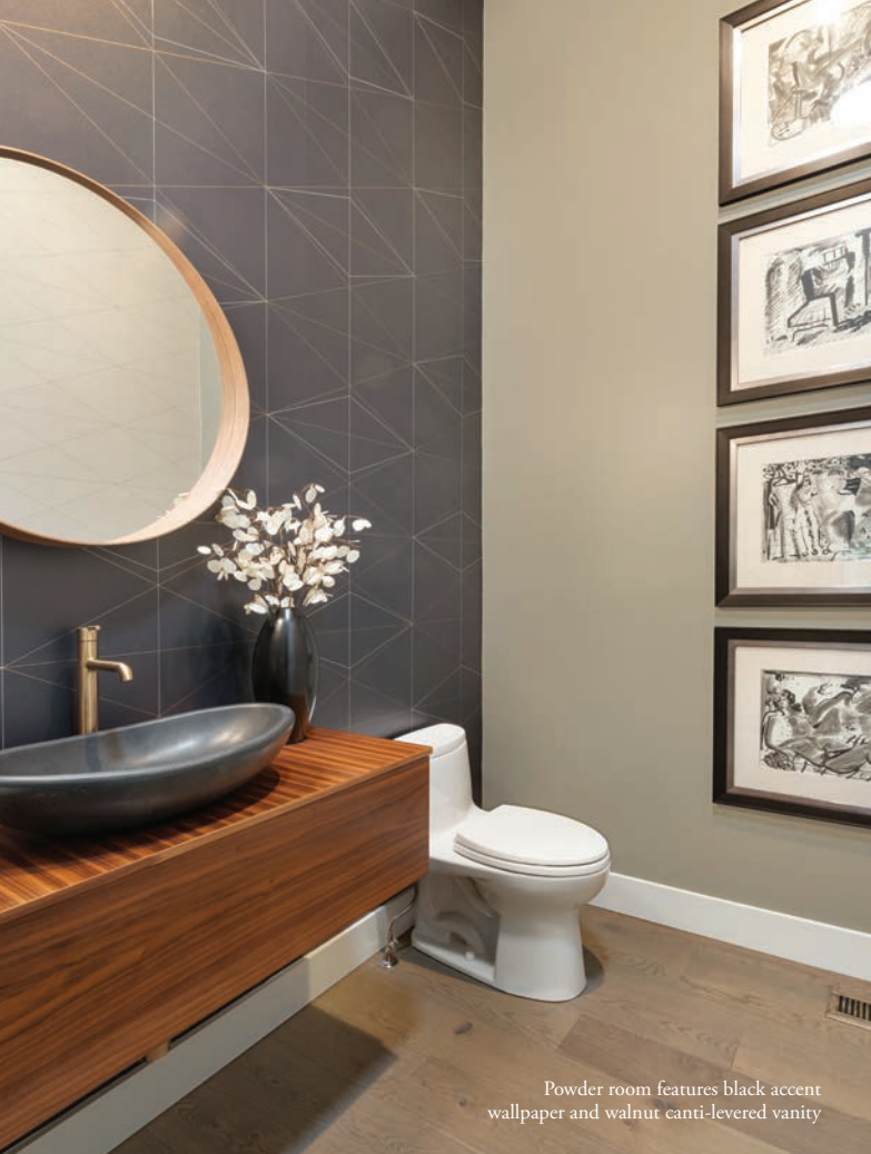
Powder room features black accent wallpaper and walnut cantilevered vanity