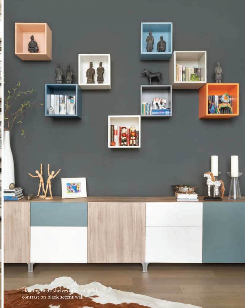
Floating bookshelves offer colorful contrast on black accent wall