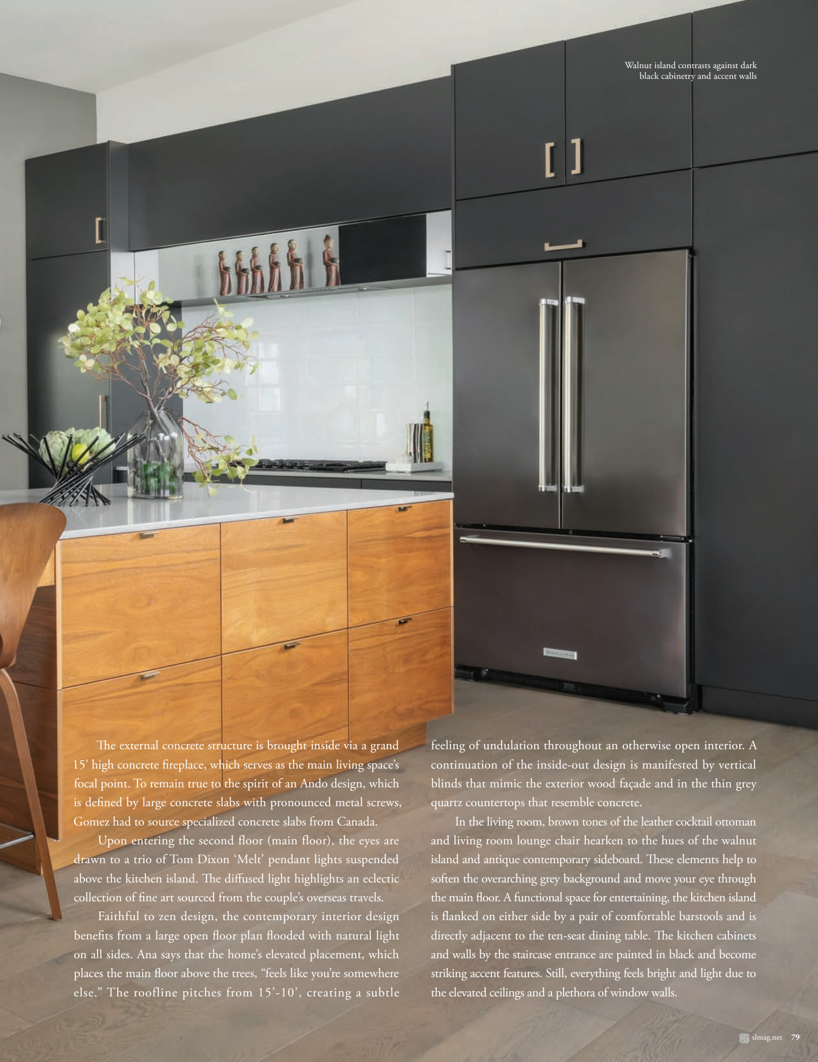
Walnut island contrasts against dark black cabinetry and accent walls

The external concrete structure is brought inside via a grand 15' high concrete fireplace, which serves as the main living space's focal point. To remain true to the spirit of an Ando design, which is defined by large concrete slabs with pronounced metal screws, Gomez had to source specialized concrete slabs from Canada.