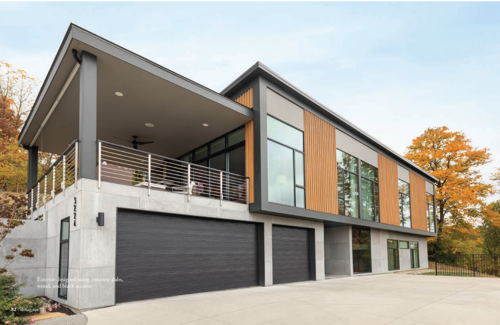
Exterior designed using concrete slabs, wood, and black accents