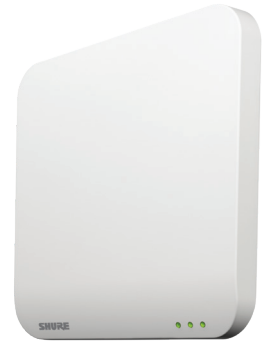
MXWAPT Access Point Transceiver