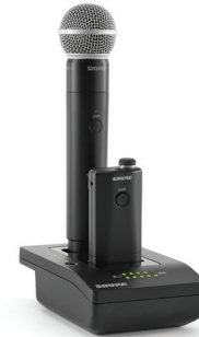
MXWNCS2 Networked Charging Station shown with MXW2/SM58 and MXW6