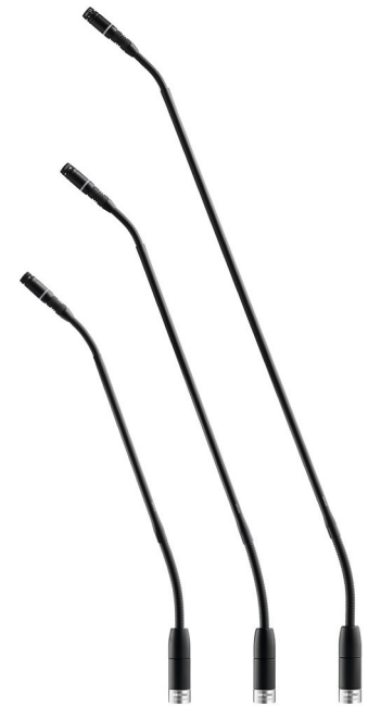
MXC Dualflex Gooseneck Microphones