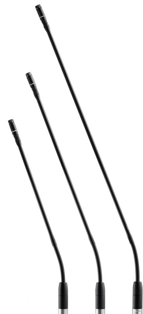
MXC Single Flex Gooseneck Microphones