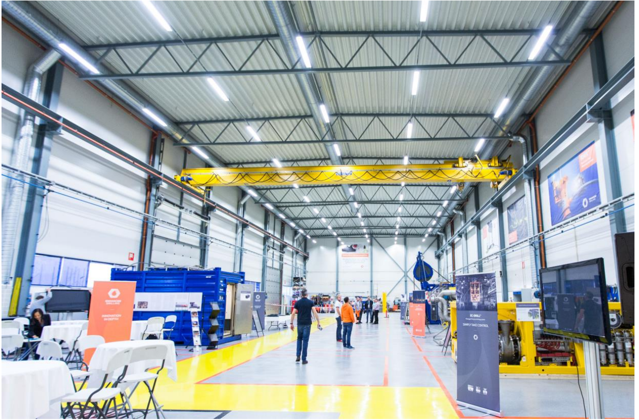
AFTER THE EVENT – getting ready to get the workshop back to 'working' mode!

Enhanced Drilling supplies innovative technical solutions and services to the global offshore industry. It has offices and facilities in Norway, Australia, Malaysia, Azerbaijan, Canada, the UK and the USA. For further information, please visit the Enhanced Drilling web at "enhanced-drilling.com" or contact us directly: