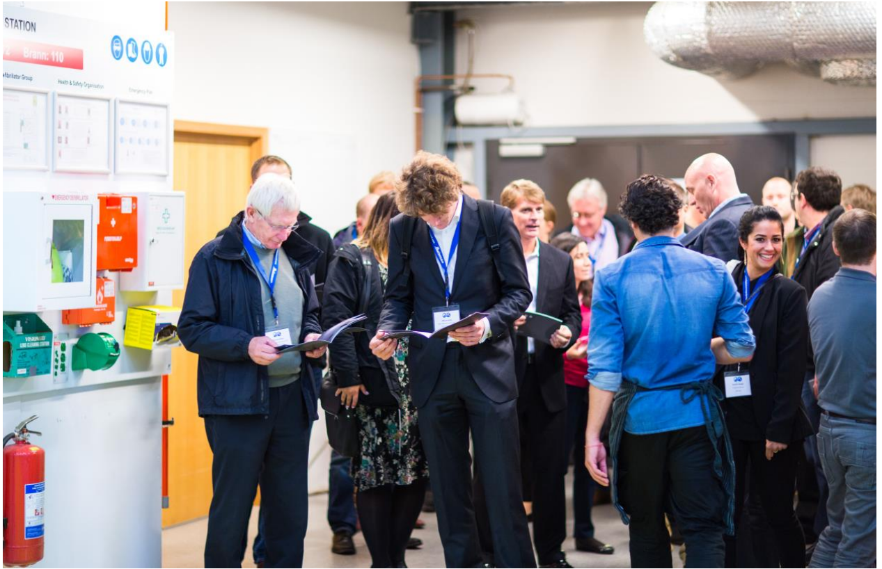
GUESTS on arrival were presented with a welcome booklet, which gave details of the tour and an overview of our technologies.