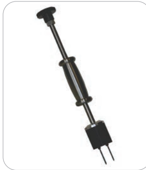
BLD5055 Heavy Duty Hammer Probe