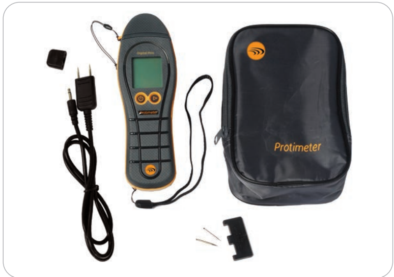
BLD5702 - Digital Mini Standard Kit