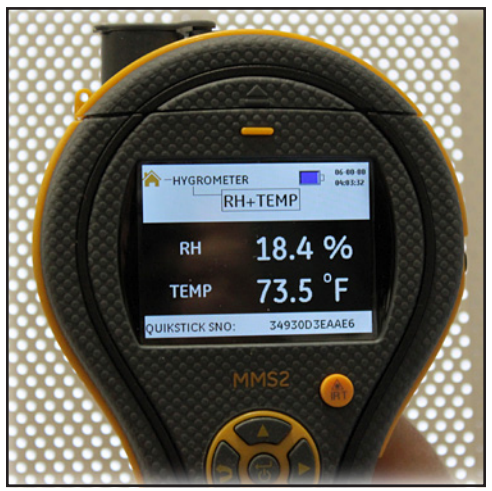
Figure 4: MMS2 as a Hygrometer

Relative humidity and temperature measurements are made with the Hygrostick, Quikstick or Short Quikstick probe, and the MMS2 instrument uses these values to calculate a range of psychometric readings. When using the MMS2 to measure the conditions in air, the humidity probe is normally connected directly to the instrument. However, when it is impractical or awkward to use the instrument in this way, the extension lead may be used to connect the Hygrostick, Quikstick or Short Quikstick to the instrument. Typically, the extension lead will be used when taking readings from probes that have been embedded in structures such as walls and floors.