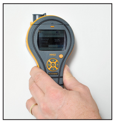
Figure 3: Taking Relative Moisture Readings

When holding the meter at the bottom, away from any objects, it Note: should not show any reading.