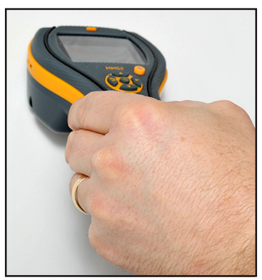
Figure 2: Using the Pin Moisture Meter

Use the up and down buttons / to navigate between different wood types. From Wood Type B to Wood Type H, if MC% is greater than 30.0, ABOVE FIBER SAT will be displayed as the wood status, otherwise the wood status will not be displayed. When using the built-in pins, the operator should make firm contact on the surface. It is not necessary or recommended to push the pins deeply below the surface.