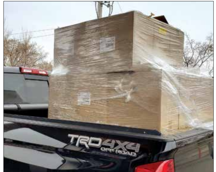
8,000 N95 respirator masks on their way to local hospitals.

P.S. Shortly after the outbreak started in Minnesota, we donated 8,000 n95 respirator masks to local hospitals (see below ) so they would be better prepared. Our At Home Fund will similarly help local families be prepared. Please give if you can at tchabitat.org/athome